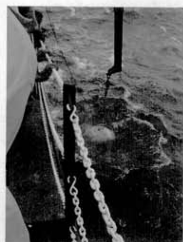
Time lapse Photography of an ADCP mooring buoy being deployed